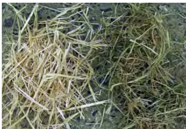
Figure 1. The traditional straw used in dairy heifer rations, wheat straw (left), is shown alongside cutter-baled rice straw (right).

Recent increases in feed costs have prompted dairy owners and nutritionists to explore new ways to optimize rations for growing heifers. In free-choice rations, dairy operators often use forages and wheat straw to provide bulk and limit feed intake. The use of rice straw, produced in high quantities in the Sacramento and northern San Joaquin Valleys, has been part of our research on dairy heifer rations since 2004. In our studies we have learned a lot about how to make rice straw a valuable feed in heifer rations as well as ways to overcome the main hurdle that has made it hard to use: incorporation of long rice straw stems into Total Mixed Ration (TMR) mixers requires substantially longer mixing times and often damages mixing equipment, necessitating shutdowns and repairs.